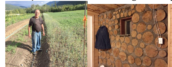
Organic Farming * Cob Cabin